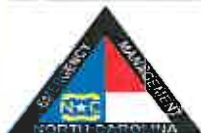
Community Emergency Response Team L427 Program Manager Course North Carolina Emergency Management Raleigh, North Carolina July 25-26, 2012