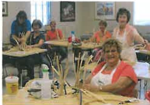
The Senior Center offers a monthly basket class.

The Seniors have been very busy lately with classes, workshops and trips.