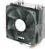
Typical CPU Cooler

Next time we will discuss the not so easy way to do this.